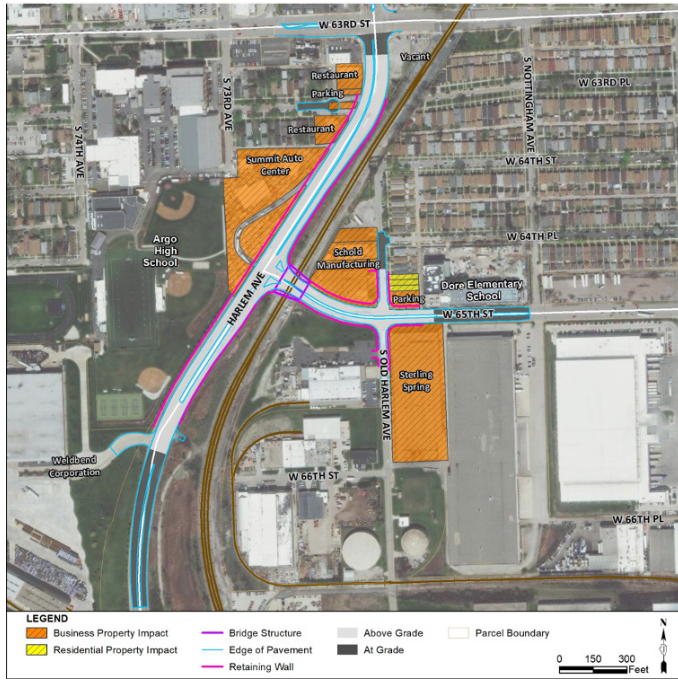
Preferred Alternative: Elevated 65th Street with Elevated Intersection

CAG Meeting #5 Summary | December 10, 2020