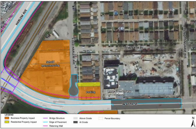
Old Harlem Avenue: Cul-de-sac (North)